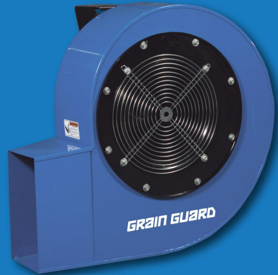
Fan Performance: Airflow (CFM) at Static Pressure (In. Water Guage)